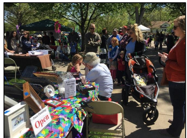
Left: The Monkey Bridge Project's balancing course was a new and successful attraction! Right: In addition to environmentally themed learning activities, there was a face painter, bouncy house, and snow cone vendor.