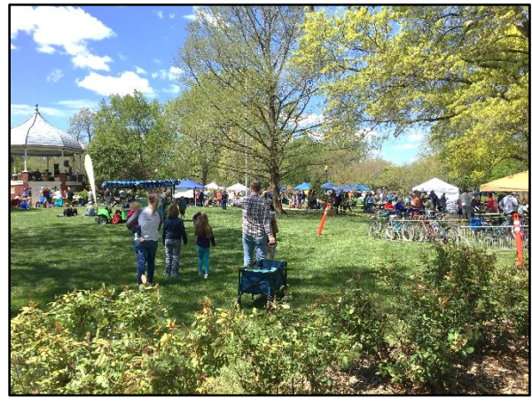
Left: City's Parks & Recreation staff provided three tree ID tours of South Park – they also displayed their electric aerial lift truck and were on site to answer questions with the Kansas Forest Service. Right: View of the park as one of the scheduled bands performed in the gazebo.