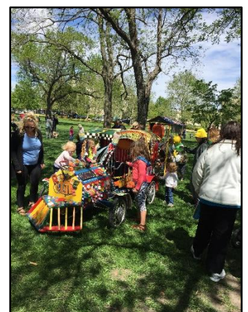
Left & Center: Celebration attendees got to choose from five local food vendors, including Boyer's Artisan Meatballs and Repetition Coffee. Right: A yearly crowd favorite, the Recycle Cycle entertained children at the event.